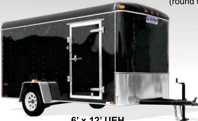
6' x 12' UEH