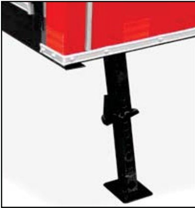
FOLD-DOWN STABILIZER JACK