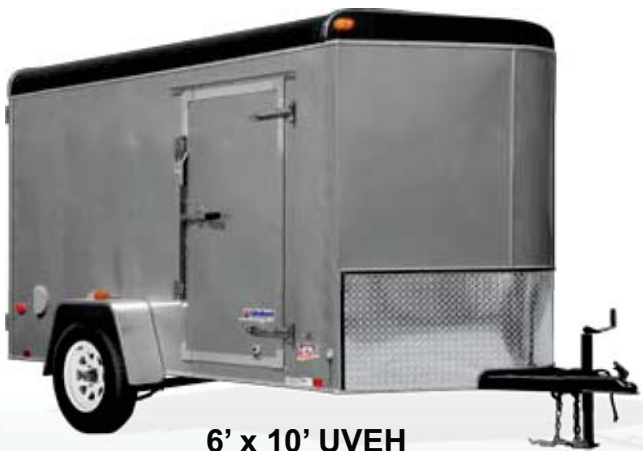
6' x 10' UVEH