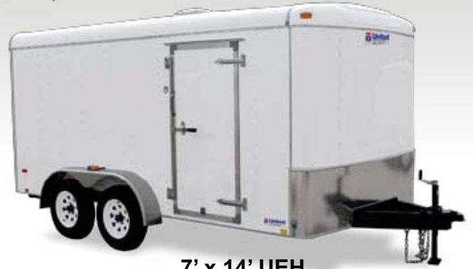
7' x 14' UEH