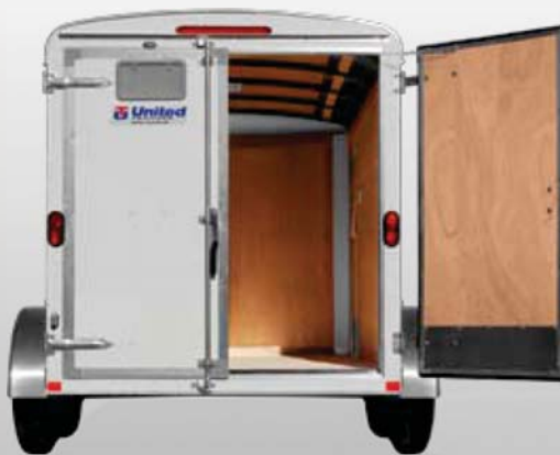
Standard Double Doors