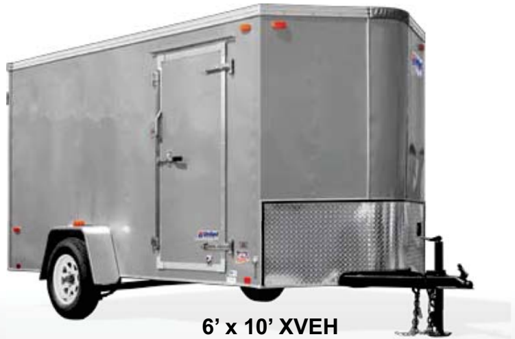
6' x 10' XVEH