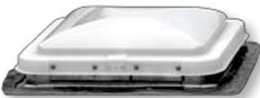
NON-POWERED ROOF VENT