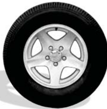
ALUMINUM STAR WHEEL