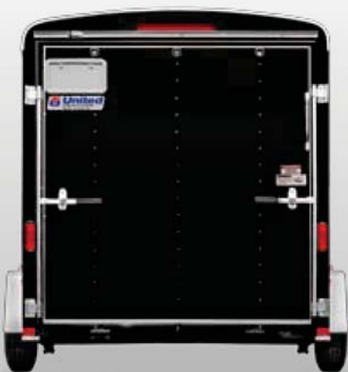
Optional Ramp Door